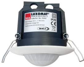
PD2N-M-DACO DALI-2 Art.No: 93452

To receive the bundle according to the technical specification, please order the items listed.