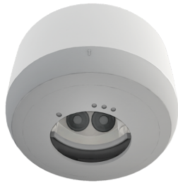
SM socle mounting set IP54 PD2N H Art.No: 93454

Voltage: 230 V AC \pm 10\% 50 Hz Dimensions: \varnothing 84 \times 85 mm Power consumption: approx. 2 W