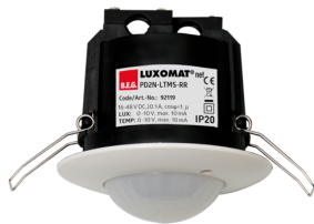
PD2N-LTMS-RR-FC Art.No: 92119

To receive the bundle according to the technical specification, please order the items listed.