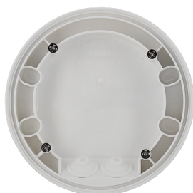
SM socle mounting set IP54 PD2N- / PD4N-FM Art.No: 93307

Voltage: via KNX BUS Dimensions: Ø 106 x 42 mm Typ. power input: 25 mA