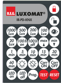
IR-PD-KNX Art.No: 92123

Dimensions: Ø 109 x 19 mm Degree / class of protection: IP54 Housing: polycarbonate, UV-resistant