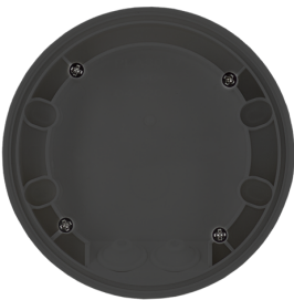
SM socle mounting set IP54 PD2N- / PD4N-FM Art.No: 93751

Dimensions: Ø 109 x 19 mm Degree / class of protection: IP54 Material color: white, similar to RAL9010