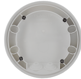
SM socle mounting set IP54 PD2N- / PD4N-FM Art.No: 93752

Battery: 3.0 V Lithium CR2032 (inclusive) Dimensions: 57 x 35 x 7 mm Material color: -