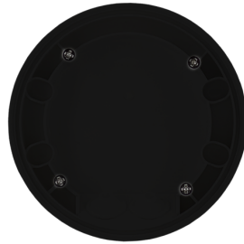
SM socle mounting set IP54 PD2N- / PD4N-FM Art.No: 93753

Battery: 3.0 V Lithium CR2032 (inclusive) Dimensions: 80 x 60 x 8 mm Material color: -