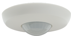
PD2N-KNXs-BA-FM Art.No: 93534

To receive the bundle according to the technical specification, please order the items listed.