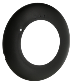
Cover ring PD2N FC