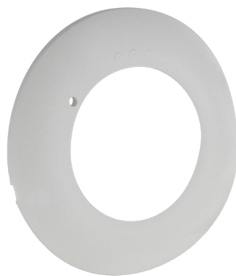
Cover ring PD2N FC

Dimensions: Ø 82 x 13 mm Impact strength: IK05 Housing: polycarbonate, UV-resistant