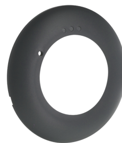
Cover ring PD2N FC

Dimensions: Ø 82 x 13 mm Impact strength: IK05 Housing: polycarbonate, UV-resistant