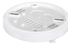
SM socket IP54 for PD2- / PD4-SM Art.No: 92161

Dimensions: Ø 200 x 90 mm Impact strength: IK09 Housing: coated steel basket