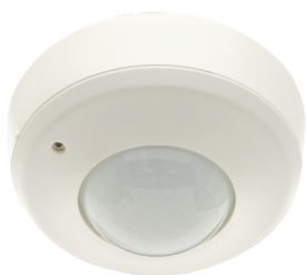
PD2-S-SM Art.No: 92152

To receive the bundle according to the technical specification, please order the items listed.