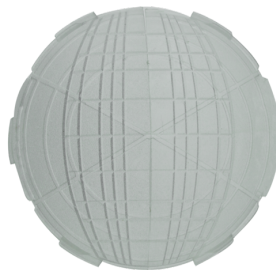
Blinds PD2-FC Art.No: 36635

Dimensions: Ø 84 x 9 mm Housing: polycarbonate, UV-resistant Material color: jet black glossy, similar to RAL9005