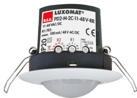
PD2-M-2C-12-48V-RR-FC Art.No: 92306

To receive the bundle according to the technical specification, please order the items listed.