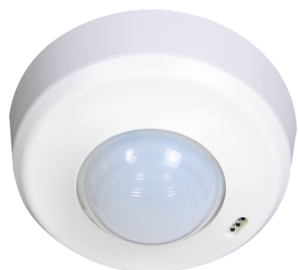
PD2-M-2C-12-48V-3A-SM Art.No: 92154

To receive the bundle according to the technical specification, please order the items listed.