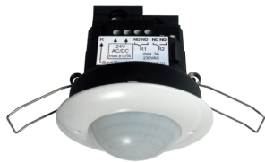
PD2-M-2C-12-48V-3A-FC Art.No: 92164

To receive the bundle according to the technical specification, please order the items listed.