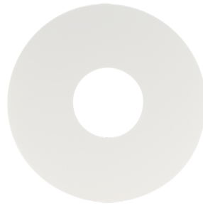
Cover ring PD11 Art.No: 92692

Dimensions: Ø 52 x 3 mm Housing: polycarbonate, UV-resistant Material color: black, similar to RAL9005