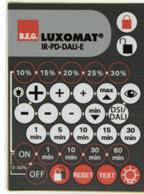
IR-PD-DALI-E Art.No: 92122

Battery: 3 x 1.5 V Micro AAA (not included) Dimensions: 83 x 53 x 17 mm Material color: -