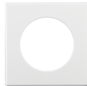
Square design frame PD11-FC Art.No: 92994

Dimensions: Ø 100 x 3 mm Housing: polycarbonate, UV-resistant Material color: white mat, similar to RAL9010