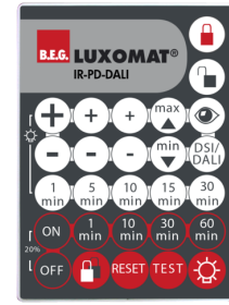
IR-PD-DALI Art.No: 92094

Dimensions: 47 x 19 x 10 mm Degree / class of protection: IP20 Ambient temperature: -20 °C to +40 °C