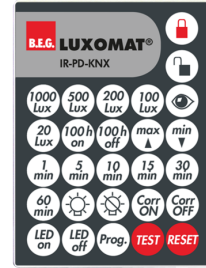
IR-PD-KNX Art.No: 92123

Dimensions: Ø 52 x 3 mm Housing: polycarbonate, UV-resistant Material color: black, similar to RAL9005