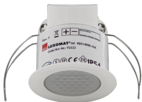
PD11-KNXs-FLAT-DX-FC Art.No: 93523

To receive the bundle according to the technical specification, please order the items listed.