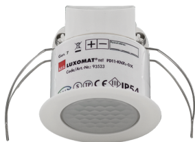
PD11-KNXs-FLAT-DX-FC Art.No: 93523

To receive the bundle according to the technical specification, please order the items listed.