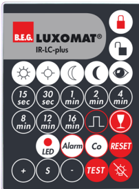
IR-LC-plus Art.No: 92095

Dimensions: 40 x 55 x 103 mm Material color: black Frequency: 2.4 GHz ISM band, GFSK 0.2 dBm + 5.3 dBi = 5.5 dBm