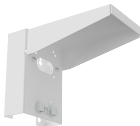
Wall holder with weather protection Art.No: 93222

Dimensions: 188 x 98 x 134 mm Housing: stainless steel Material color: stainless steel