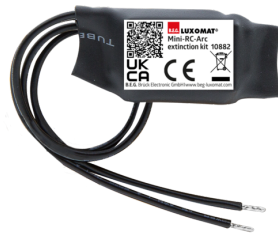
Mini-RC-Arc extinction kit Art.No: 10882

Voltage: 230 V AC \pm 10\% Dimensions: 38 x 12 x 26 mm Degree / class of protection: IP20 / Class II