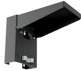
Wall holder with weather protection Art.No: 93221

Dimensions: 188 x 98 x 134 mm Material color: white