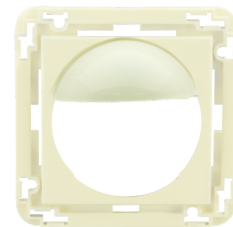
Central plate Indoor 180 45x45 Art.No: 39076

Dimensions: 45 x 45 mm Material color: traffic white mat, similar to RAL9016