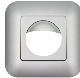
Frame IP20 Indoor 180 Art.No: 92633

Dimensions: 86 x 86 mm Degree / class of protection: IP20 Housing: polycarbonate, UV-resistant