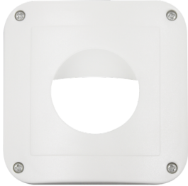
Frame IP54 Indoor 180 Art.No: 92139

Dimensions: 86 x 86 mm Degree / class of protection: IP20 Housing: polycarbonate, UV-resistant