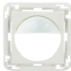
Central plate Indoor 180 45x45 Art.No: 38947

Dimensions: 88 x 88 x 42 mm Degree / class of protection: IP54 Impact strength: IK05