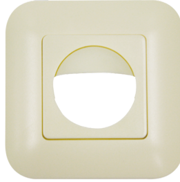
Frame IP20 Indoor 180 Art.No: 92632

Dimensions: 87 x 87 mm Degree / class of protection: IP54 Housing: polycarbonate, UV-resistant