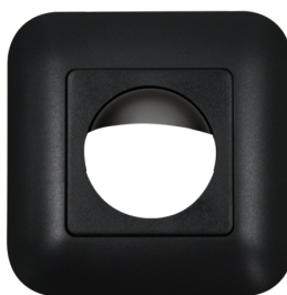
Frame IP20 Indoor 180 Art.No: 92634

Voltage: 11 - 48 V AC / DC Dimensions: covering not included 70 x 70 x 61 mm Power consumption: approx. 1 W