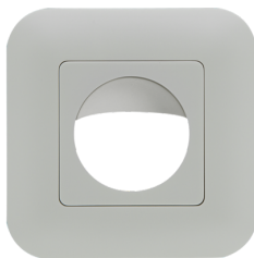
Frame IP20 Indoor 180 Art.No: 92630

Voltage: 11 - 48 V AC / DC Dimensions: covering not included 70 x 70 x 61 mm Power consumption: approx. 1 W