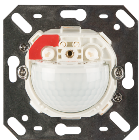
Indoor 180-M-2C covering not included Art.No: 92661

To receive the bundle according to the technical specification, please order the items listed.