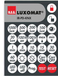
IR-PD-KNX Art.No: 92123

Dimensions: 47 x 19 x 10 mm Degree / class of protection: IP20 Ambient temperature: -20 °C to +40 °C