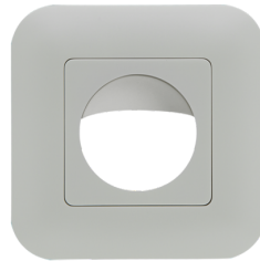
Frame IP20 Indoor 180 Art.No: 92630

Battery: 3.0 V Lithium CR2032 (inclusive) Dimensions: 57 x 35 x 7 mm Material color: -