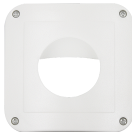
Frame IP54 Indoor 180 Art.No: 92139

Dimensions: 86 x 86 mm Degree / class of protection: IP20 Housing: polycarbonate, UV-resistant