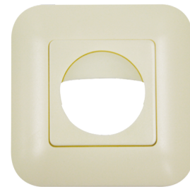
Frame IP20 Indoor 180 Art.No: 92632

Dimensions: 87 x 87 mm Degree / class of protection: IP54 Housing: polycarbonate, UV-resistant