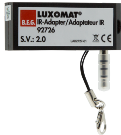
IR-Adapter for Smartphones Art.No: 92726

Dimensions: 40 x 55 x 103 mm Material color: black Frequency: 2.4 GHz ISM band, GFSK 0.2 dBm + 5.3 dBi = 5.5 dBm