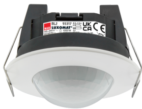
BL2-FC Art.No: 93317

To receive the bundle according to the technical specification, please order the items listed.