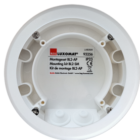
Mounting set BL2-SM Art.No: 93256

Voltage: 110 – 240 V Dimensions: Ø 80 x 61 mm Power consumption: 0.3 W