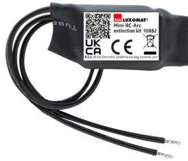
Mini-RC-Arc extinction kit Art.No: 10882

Voltage: 230 V AC \pm 10\% Dimensions: 38 x 12 x 26 mm Degree / class of protection: IP20 / Class II