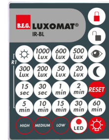
IR-BL Art.No: 93055

Voltage: 230 V AC \pm 10\% Dimensions: 50 x 23 x 8 mm Degree / class of protection: IP20 / Class II