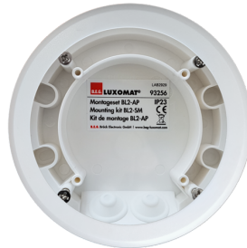
Mounting set BL2-SM Art.No: 93256

Dimensions: 40 x 55 x 103 mm Material color: black Frequency: 2.4 GHz ISM band, GFSK 0.2 dBm + 5.3 dBi = 5.5 dBm