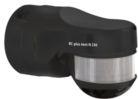
RC-plus next N 230 KNXs-DX Art.No: 93528

To receive the bundle according to the technical specification, please order the items listed.