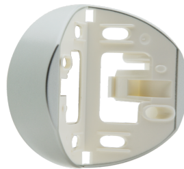
Outside corner socket RC-plus next Art.No: 97043

Dimensions: Ø 164 x 143 mm Impact strength: IK09 Housing: coated steel basket