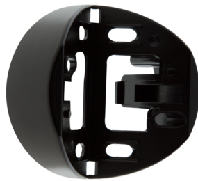
Outside corner socket RC-plus next Art.No: 97024

Dimensions: Ø 164 x 143 mm Impact strength: IK09 Housing: coated steel basket