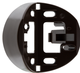
Outside corner socket RC-plus next Art.No: 97014

Dimensions: Ø 164 x 143 mm Impact strength: IK09 Housing: coated steel basket