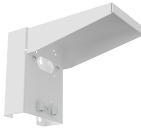
Wall holder Art.No: 93222

Dimensions: 188 x 98 x 134 mm Housing: stainless steel Material color: stainless steel