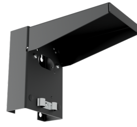
Wall holder Art.No: 93221

Dimensions: 188 x 98 x 134 mm Material color: white