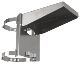
Pole holder Art.No: 93220

Dimensions: 188 x 98 x 134 mm Housing: stainless steel Material color: stainless steel