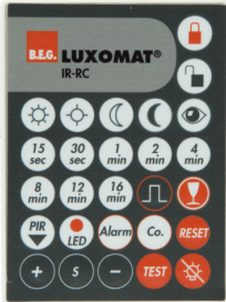
IR-RC Art.No: 92000

Dimensions: 40 x 55 x 103 mm Material color: black Frequency: 2.4 GHz ISM band, GFSK 0.2 dBm + 5.3 dBi = 5.5 dBm