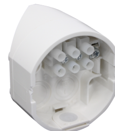
Inside corner socket RC-plus next Art.No: 97005

Dimensions: Ø 71 x 34 mm Degree / class of protection: IP54 Housing: polycarbonate, UV-resistant