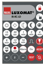
IR-RC-LD Art.No: 92649

Battery: 3.0 V Lithium CR2032 (inclusive) Dimensions: 80 x 60 x 8 mm Material color: -