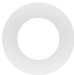
Cover ring PD9 Ø 36 mm

Dimensions: Ø 36 mm Housing: polycarbonate, UV-resistant Material color: anthracite glossy