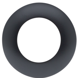
Cover ring PD9 Ø 36 mm