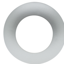
Cover ring PD9 Ø 36 mm

Dimensions: Ø 36 mm Housing: polycarbonate, UV-resistant Material color: white glossy