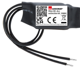
Mini-RC-Arc extinction kit Art.No: 10882

Battery: 3.0 V Lithium CR2032 (inclusive) Dimensions: 57 x 35 x 7 mm Material color: -