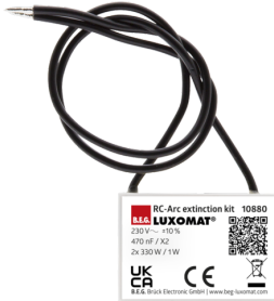
RC-Arc extinction kit Art.No: 10880

Dimensions: 40 x 55 x 103 mm Material color: black Frequency: 2.4 GHz ISM band, GFSK 0.2 dBm + 5.3 dBi = 5.5 dBm