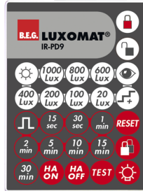
IR-PD9 Art.No: 92201

Voltage: 230 V AC \pm 10\% Dimensions: 38 x 12 x 26 mm Degree / class of protection: IP20 / Class II