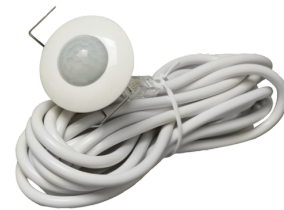
PD9-S-SDB-FC Art.No: 92915

Voltage: 230 V AC ±10% Dimensions: 50 x 23 x 8 mm Degree / class of protection: IP20 / Class II