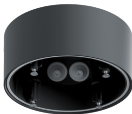
SM socle mounting set IP54 PD4N H Art.No: 93786

Voltage: 230 V AC \pm 10\% 50 Hz Dimensions: \varnothing 106 \times 95 mm Power consumption: approx. 2 W