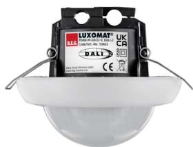
PD4N-M-DACO-1C DALI-2 Art.No: 93463

To receive the bundle according to the technical specification, please order the items listed.