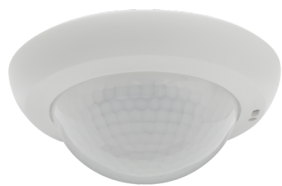
PD4N-KNXs-ST-FM Art.No: 93515

To receive the bundle according to the technical specification, please order the items listed.