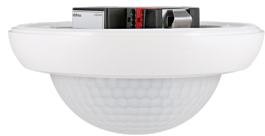
PD4N-KNXs-DX-FM Art.No: 93517

To receive the bundle according to the technical specification, please order the items listed.