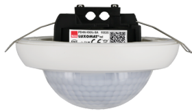
PD4N-KNXs-BA-FC Art.No: 93535

To receive the bundle according to the technical specification, please order the items listed.