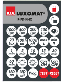
IR-PD-KNX Art.No: 92123

Dimensions: 40 x 55 x 103 mm Material color: black Frequency: 2.4 GHz ISM band, GFSK 0.2 dBm + 5.3 dBi = 5.5 dBm