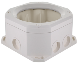
SM socle mounting set IP65 PD4N Art.No: 93314

Dimensions: Ø 200 x 90 mm Impact strength: IK09 Housing: coated steel basket