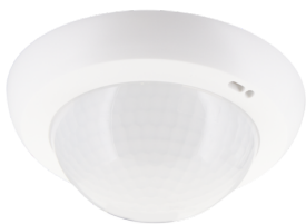
lens PD4N, Cover ring Art.No: 93732

Detection area: horizontal 360° (Ceiling mounting) Range: max. &Oslash; 24 m across<br>max. &Oslash; 8 m towards<br>max. &Oslash; 6.4 m seated Monitored area (tangential movement): 450 m 2 / 2.5 m mounting height