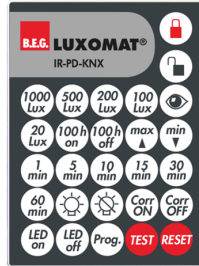
IR-PD-KNX Art.No: 92123

Dimensions: 40 x 55 x 103 mm Material color: black Frequency: 2.4 GHz ISM band, GFSK 0.2 dBm + 5.3 dBi = 5.5 dBm