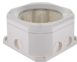
SM socle mounting set IP65 PD4N Art.No: 93314

Dimensions: Ø 200 x 90 mm Impact strength: IK09 Housing: coated steel basket