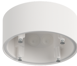
SM socle mounting set IP54 PD4N H Art.No: 93465

Voltage: 230 V AC \pm 10\% 50 Hz Dimensions: \varnothing 106 x 95 mm Settings: Casambi App