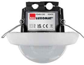
PD4N-CAS Art.No: 93474

To receive the bundle according to the technical specification, please order the items listed.