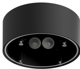
SM socle mounting set IP54 PD4N H Art.No: 93788

Voltage: 230 V AC \pm 10\% 50 Hz Dimensions: \varnothing 106 \times 95 mm Settings: Casambi App