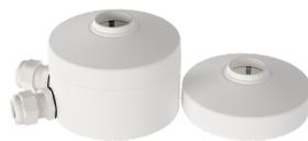
Pendulum mounting set PD2/3/4 SM Art.No: 93179

Dimensions: Ø 200 x 90 mm Impact strength: IK09 Housing: coated steel basket