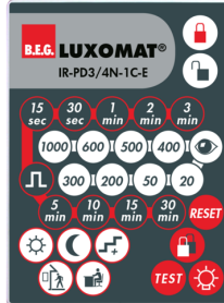
IR-PD3/4N-1C-E Art.No: 93110

Battery: 3.0 V Lithium CR2032 (inclusive) Dimensions: 80 x 60 x 8 mm Material color: -