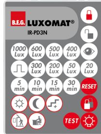
IR-PD3N Art.No: 92105

Dimensions: 47 x 19 x 10 mm Degree / class of protection: IP20 Ambient temperature: -20 °C to +40 °C