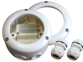
Surface mounting socket IP65 PD4-SM IP54 Art.No: 92376

Dimensions: 40 x 55 x 103 mm Material color: black Frequency: 2.4 GHz ISM band, GFSK 0.2 dBm + 5.3 dBi = 5.5 dBm