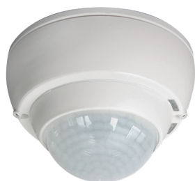
PD4-M-TRIO-2DALI/DSI-1C-SM Art.No: 92751

To receive the bundle according to the technical specification, please order the items listed.