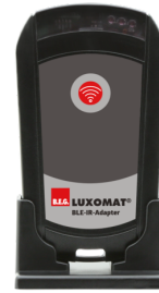
BLE-IR-Adapter Art.No: 93067

Voltage: 230 V AC ±10% Dimensions: 50 x 23 x 8 mm Degree / class of protection: IP20 / Class II