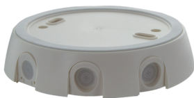
Socket IP54 PD4-TRIO-SM Art.No: 92386

Dimensions: Ø 164 x 143 mm Impact strength: IK09 Housing: coated steel basket