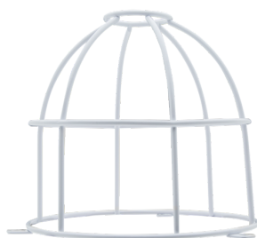
Wire basket BSK ( \varnothing 164 \times 143 mm) Art.No: 92467

Voltage: 230 V AC \pm 10\% 50 Hz Dimensions: \varnothing 124 \times 85 mm Power consumption: approx. 2 W