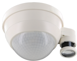
PD4-M-DACO-GH-SM DALI-2 Art.No: 93469

To receive the bundle according to the technical specification, please order the items listed.