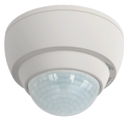
PD4-M-2C-DS-SM Art.No: 92761

To receive the bundle according to the technical specification, please order the items listed.