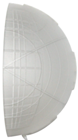
Blinds PD4 Art.No: 92313

Dimensions: Ø 200 x 90 mm Impact strength: IK09 Housing: coated steel basket