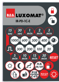
IR-PD-1C-E Art.No: 92077

Battery: 3.0 V Lithium CR2032 (inclusive) Dimensions: 80 x 60 x 8 mm Material color: -