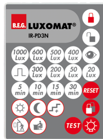
IR-PD3N Art.No: 92105

Battery: 3.0 V Lithium CR2032 (inclusive) Dimensions: 80 x 60 x 8 mm Material color: -